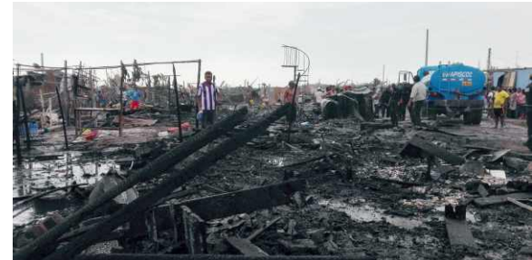
100 HOMES BURNED TO THE GROUND IN PISCO