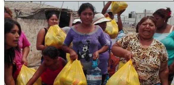
BAGS OF FOOD AND WATER FOR MANY FAMILIES IN NEED