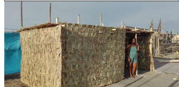
TEMPORARY SHELTERS FOR FAMILIES IN NEED IN PISCO