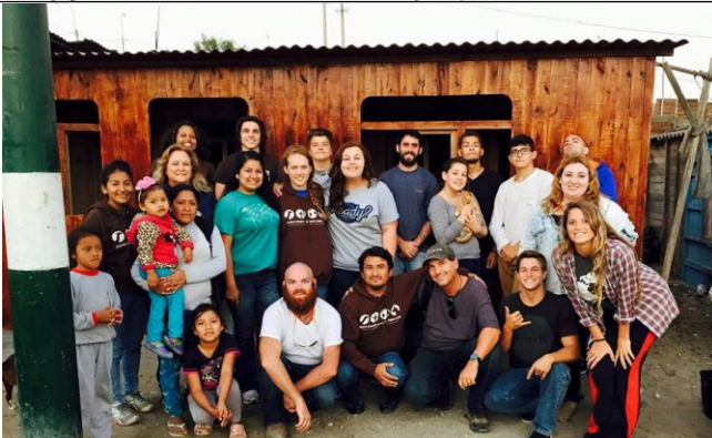
The Cross Street Mission Team split up to build two prefab homes. Here are pictures of the teams and the homes that they built.