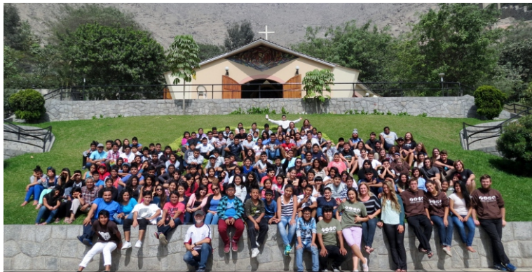
Group picture from the 2015 Lima, Peru - Cross Street Youth Camp. Many gave their hearts to the Lord and many responded to the call to missions.

This world must be reached with the Gospel. Jesus gave up His' life to save this world. Will we give up our lives for the same purpose? It's God's will that this world be saved. Is it yours?