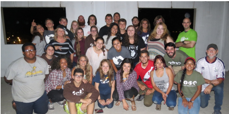
Group picture of the 2015 Cross Street Peru Mission Team, definitely one of our best and most productive mission teams ever! Gloria a Dios!!

We all should begin to cry out to God in faith to flood every area of our lives - moral, ministry, and more. After all, He has promised to give the Holy Spirit to whoever asks (Luke 11:13). When we do receive a fresh touch from God for ministry, it's easy to think that we have "arrived". We settle for last year's "anointing", and never press forward to a higher level of usefulness. Avoiding this, In preparation for our recent Peru trip, we made it a point to ask God to do more through us than He had done the previous year. If God has promised to exceed our expectations, then it is only right to be desperate for more. We should never be satisfied to stay in one place. I remember it being prayed many times in our Peru meetings - "God, we don't want last year's results. We want a fresh move of your Holy Spirit."